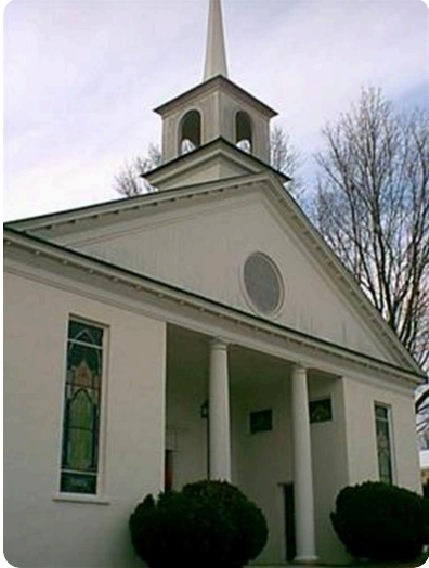
Friends Flint Hill United Methodist Church